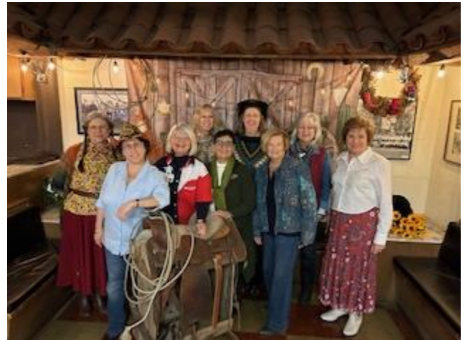
AAUW Friends at Friends of the Library